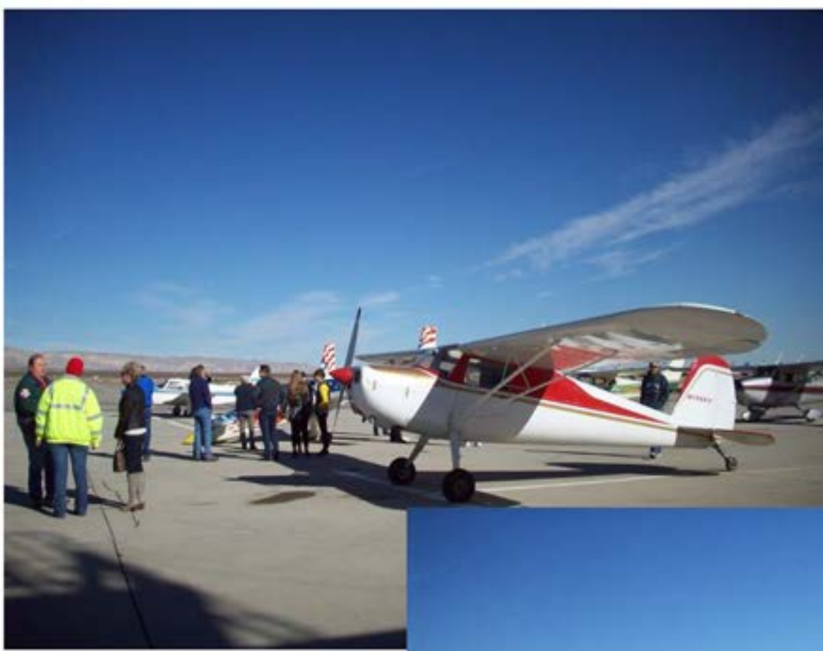
Look what Dustin Mosher is flying now! A sweet little 1947 Cessna 120!